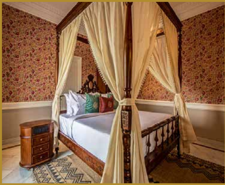
The rooms at Raajkutir have an old-world charm