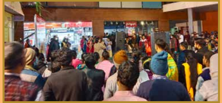
City Centre Siliguri recently hosted a Tourism Fair that saw huge crowds on the premises, curious about travel