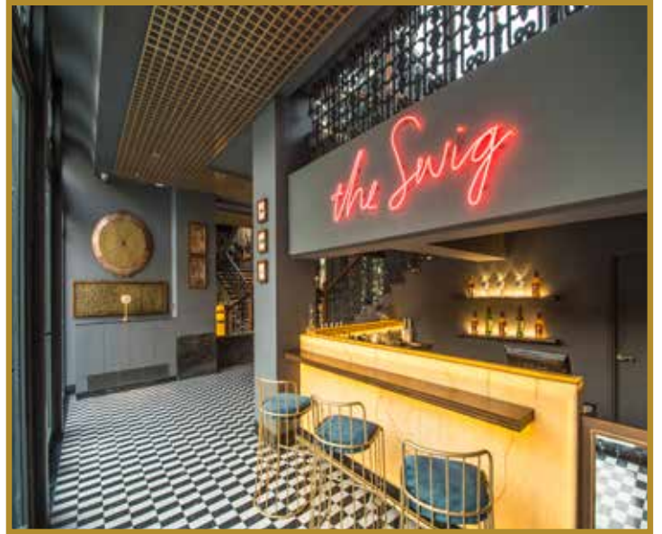
The Swig is where you relax and revive your spirit