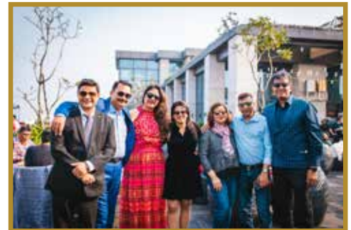
The Christmas 'turkey brunch' at AltAir, with Band Voicez live music, had guests enjoy a mellow afternoon of food and fun