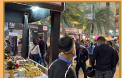
City Centre Salt Lake and New Town's 'Bakery Fest' was an instant hit with those who like their cake and eat it too!