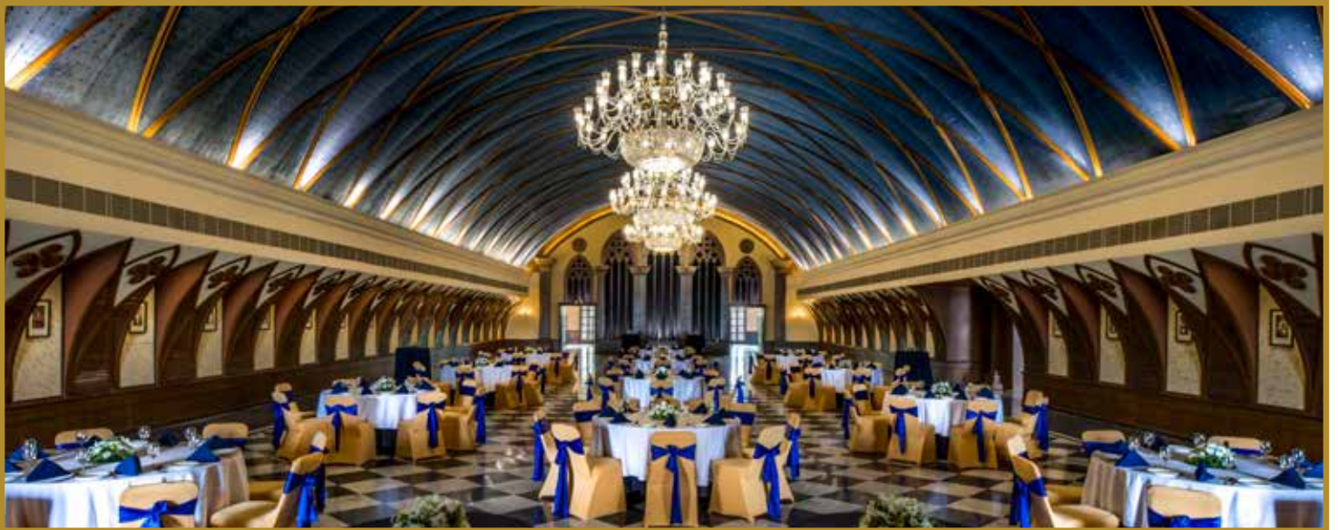
Rangmanch, the banqueting facility, embodies all the grandure of a Jalsaghar