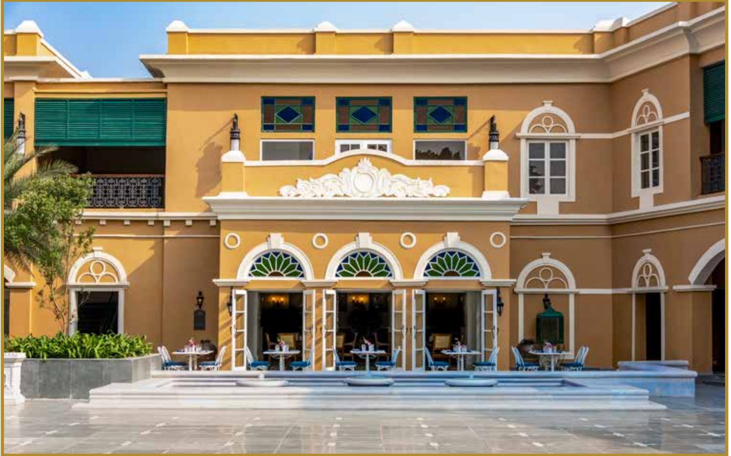
Raajkutir embodies the quintessential spirit of Bengal renaissance

An event to celebrate as Raajkutir was recently branded as an IHCL SeleQtions hotel after India Hotel Company (IHCL) signed a partnership with the Ambuja Neotia Group recently.