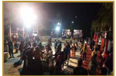
City Centre Haldia held a 'Happy Feast Food Festival' recently over Christmas to give guests a taste of various cuisines