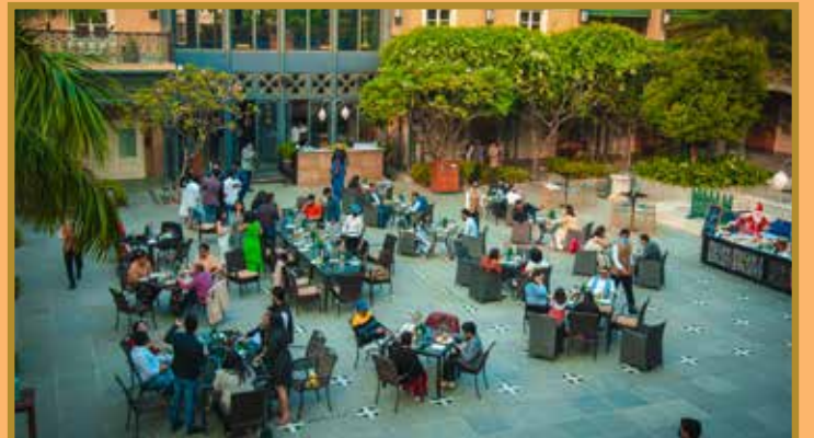
The signature Raajkutir Christmas Brunch at The Courtyard was much appreciated by gourmards and foodies of the city