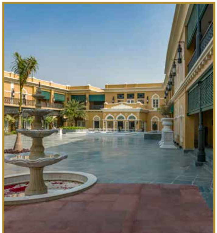
Another view of Raajkutir that harks back to zamindaari Kolkata

With the addition of this hotel, IHCL will now have seven hotels across brands in West Bengal.