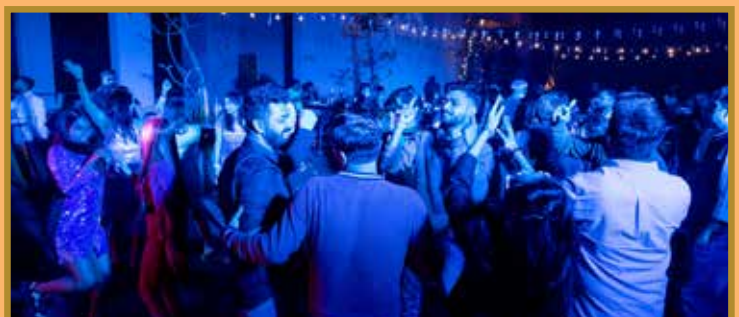
It was a special New Year's Eve celebration at AltAir with celebrity Shanaya from Mumbai and a crowded dance floor