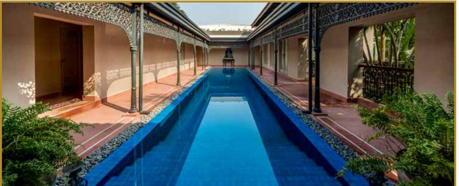
The swimming pool at Raajkutir