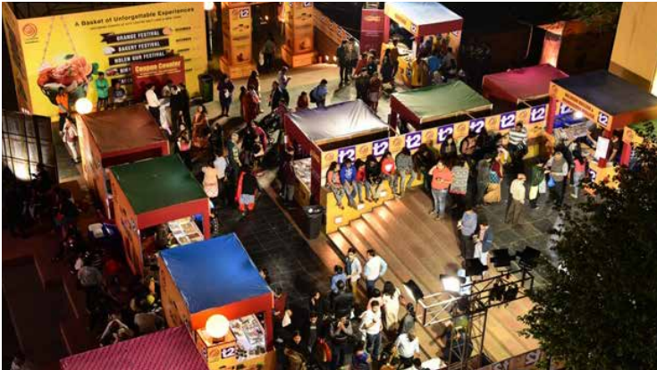
A festival to celebrate nolen gur, Bengal's famous date palm jaggery, was held at the City Centre New Town to pamper Kolkata's sweet tooth