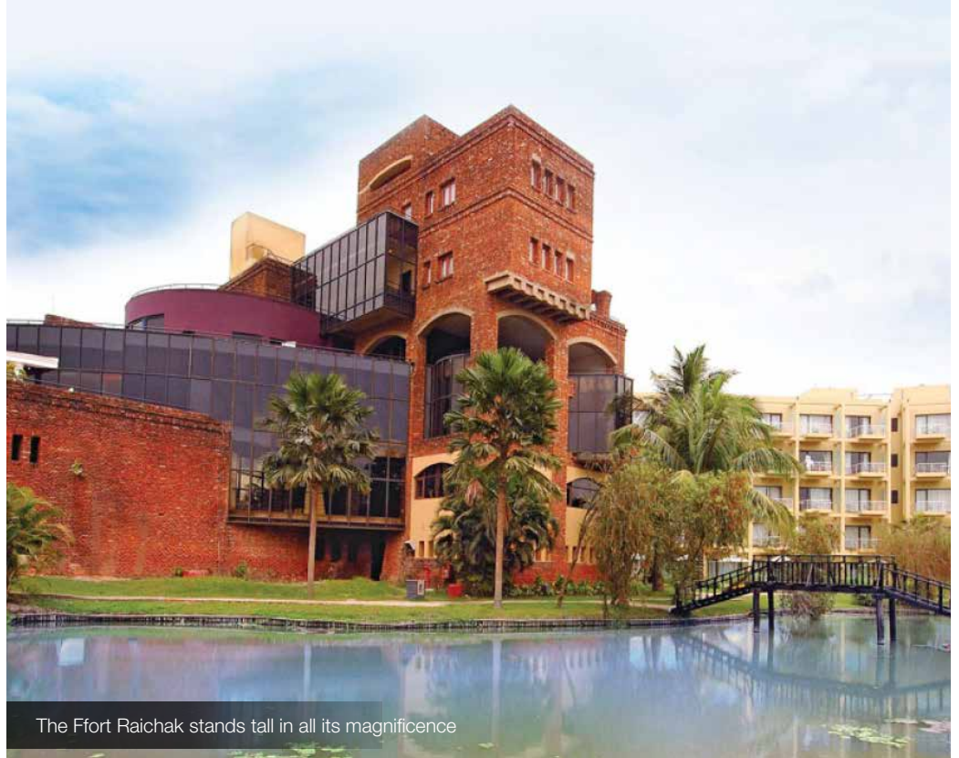
The Ffort Raichak stands tall in all its magnificence

R aichak on Ganges is a unique leisure destination about an hour and a half away from Kolkata's rush and flurry. Located on the banks of the Hooghly and spread across 100 acres, it retains an atmosphere of peace and tranquility. Comprising hotels, resorts, private garden homes and restaurants, including The Ffort Raichak, Ganga Kutir and Sonar Tori, Raichak on Ganges is a magnificent echo of nature's bounty designed to provide serene retreats. You can watch breathtaking sunrises and sunsets, watch the river in myriad moods, spend time in the gardens, use the spa, swim, watch birds during daytime or a fistful of stars showering their benediction as dusk steals across the sky. The choice is yours!