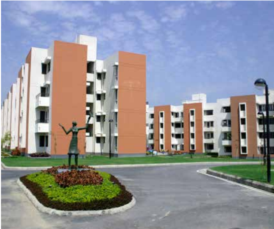
LIG apartments in a well-landscaped space at Uttorayon