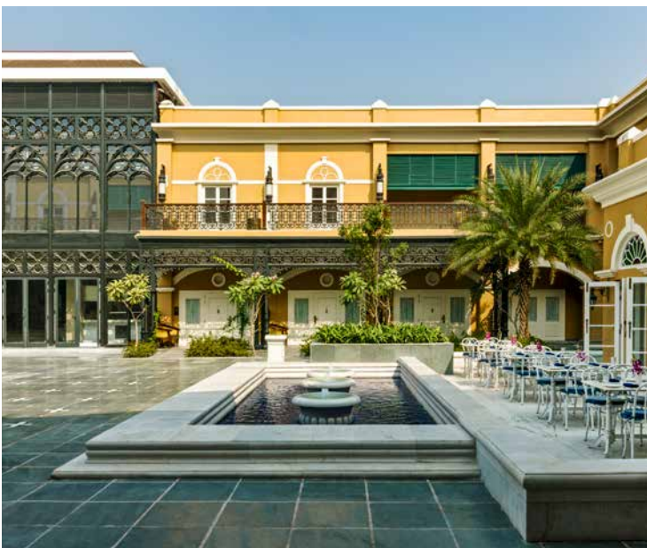
The enchanting alfresco dining area at East India Room