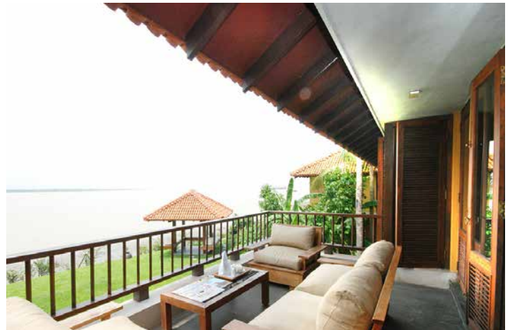
The balconies of Ganga Kutir overlook the river