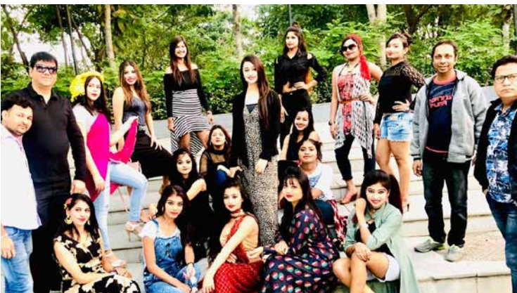
City Centre Raipur recently hosted Mr and Miss Chattisgarh 2019