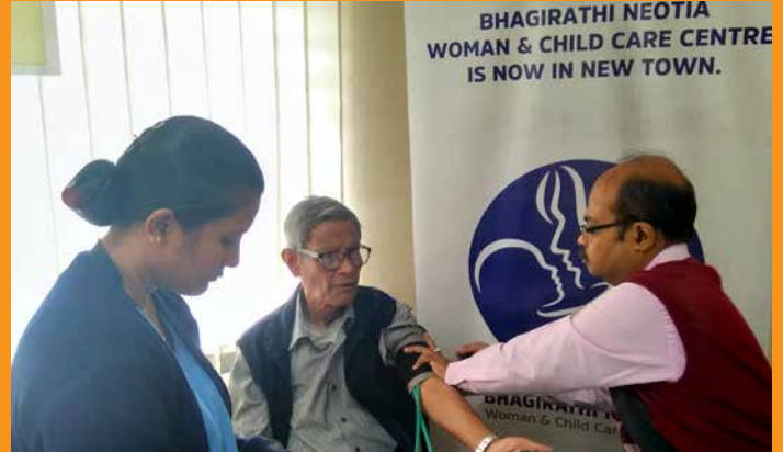
BNWCC, New Town, recently organised a Health Checkup Camp for the customers and employees of Bank of Baroda, Rajarhat