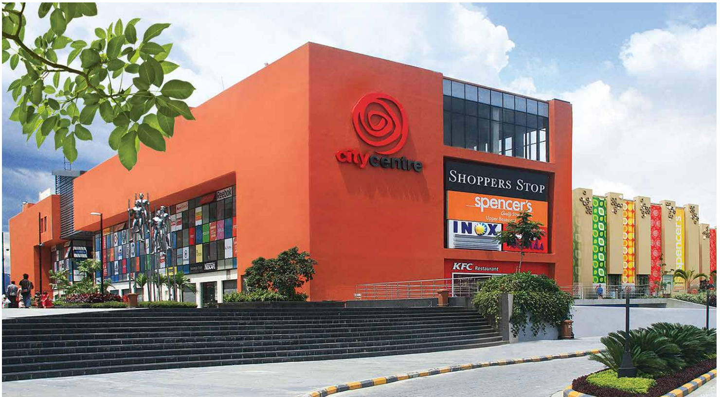
City Centre Siliguri at Uttorayon