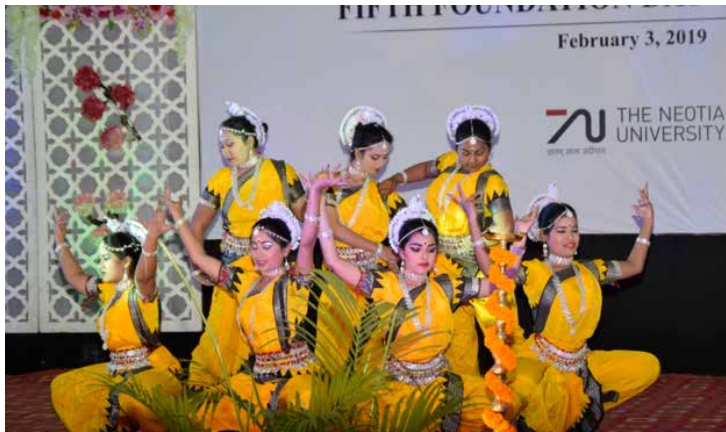
A cultural performance by students on Foundation Day