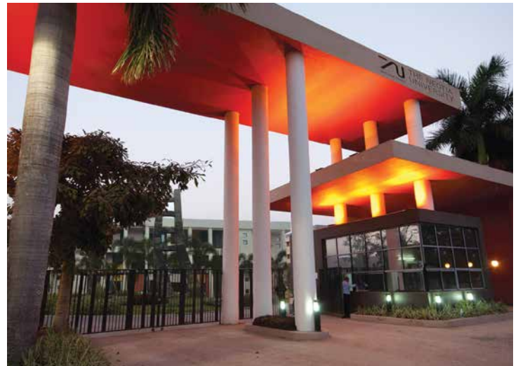
The impressive main entrance of The Neotia University