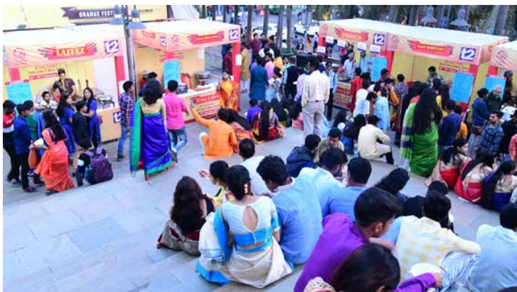
City Centre New Town hosted a biryani festival that drew massive crowds