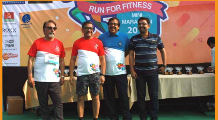
BNWCCC, Rawdon Street, was the healthcare partner of the Calcutta Swimming Club Run for Fitness Mini Marathon 2019