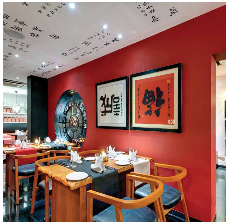
A section of the The Orient, the fine-dining South Asian restaurant