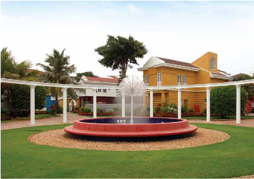
Landscaping at Raichak on Ganges