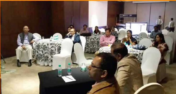
BNWCCC, New Town, in association with Pfizer, arranged an important panel discussion on Paediatric Antibiotic Stewardship