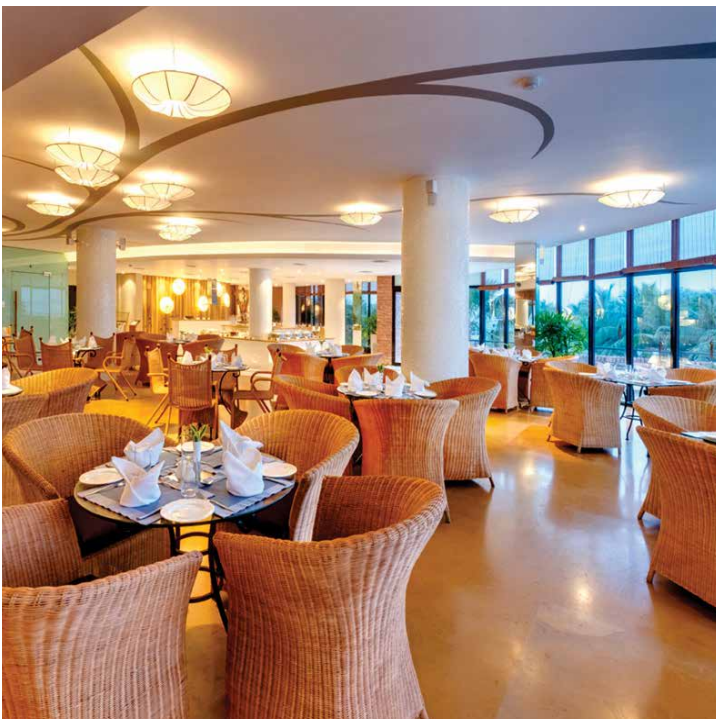
A view of Reflections, the restaurant at Raichak on Ganges