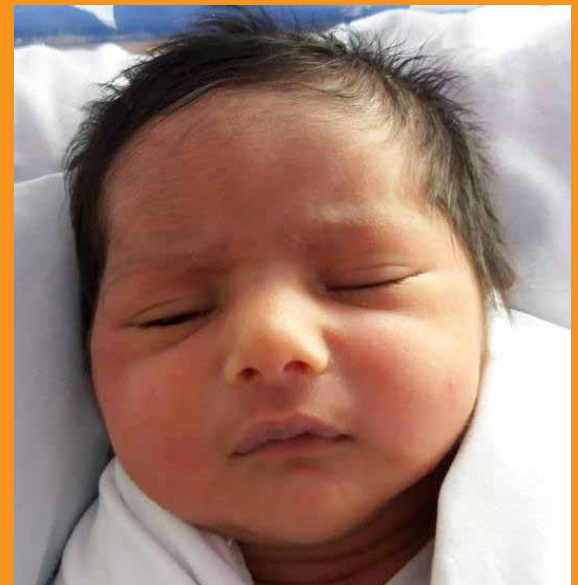
A time for celebrations! BNWCCC New Town welcomed its 500th baby born at the hospital in February to much rejoicing and cheers