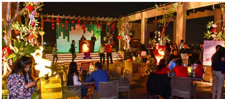
Valentine's Day was ushered in with great style, lively music and a gala dinner at Altair, Kolkata's new happening spot in Sector V