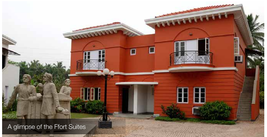
A glimpse of the Ffort Suites