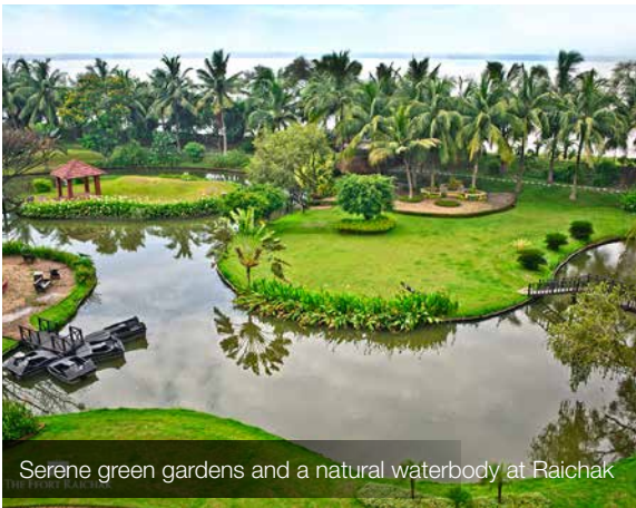
Serene green gardens and a natural waterbody at Raichak