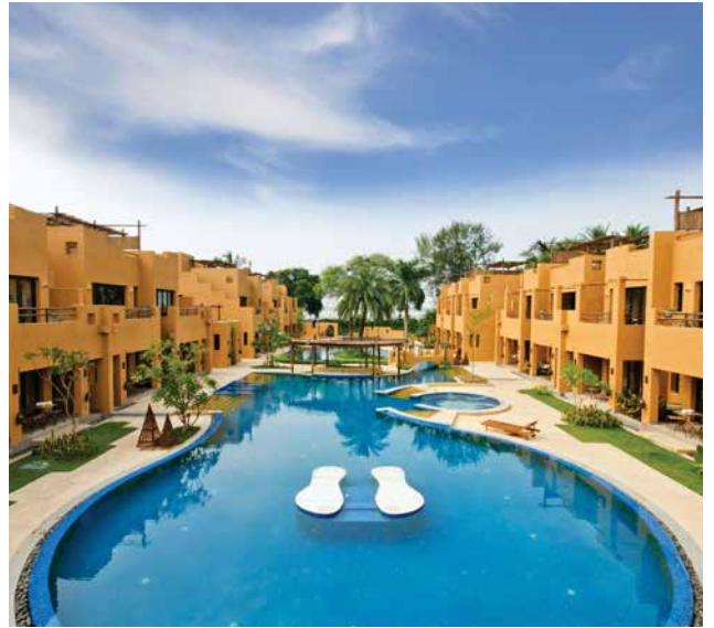
A picturesque view of Anaya