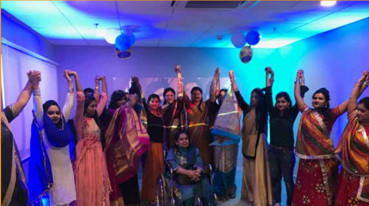
The first anniversary of Bhagirathi Neotia Woman and Child Care Centre, New Town, was celebrated on the hospital premises