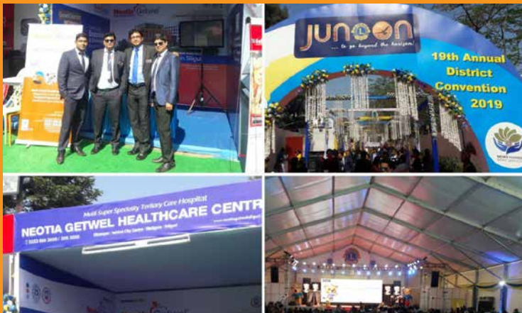
Neotia Getwel Healthcare Centre participated in the 19th District Convention, Junoon, by Lions Club International at Uttorayon ,Siliguri