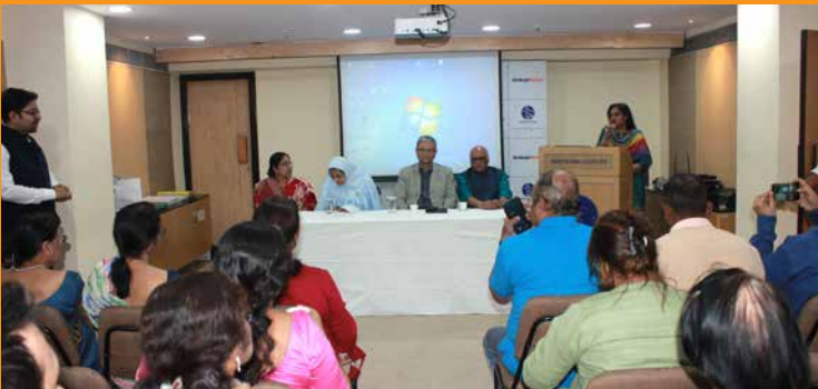
BNWCCC, Rawdon Street, fronted a programme on Cervical Cancer Management & Prevention for members of Rotary Club