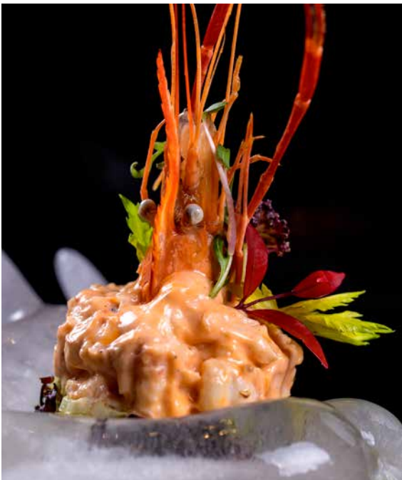
The famous Prawn Cocktail at East India Room