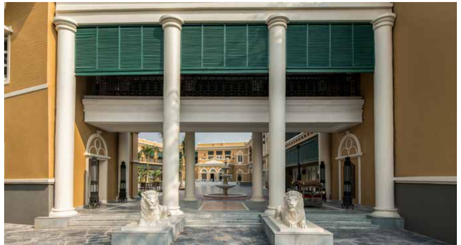
The entrance to Raajkutir at Swabhumi

R aajkutir, the boutique hotel in Swabhumi, Kolkata, now sports the East India Room, a fine-dining restaurant that captures the essence of 19th century Bengal, both in terms of food and architecture. Bengal has been a vibrant melting pot of different cultures. The meals served at the East India Room are thus inspired from Kolkata's history that has accommodated a gamut of traditions. Specializing in 19th century Bengali cuisine, the menu has been curated for its distinctiveness and how everything came together to shape the culinary aspirations formed in the kitchens of colonial times. East India Room will certainly take you on a delectable gastronomic journey through Bengal's glorious past expressed through food and an imaginative décor.