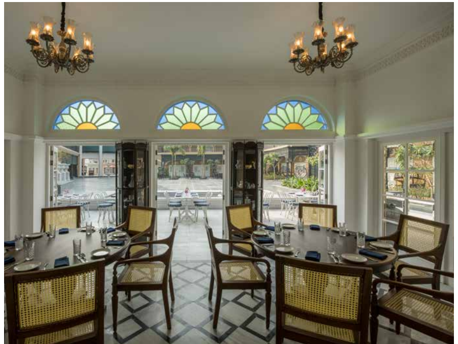
A view of East India Room's unique colonial interiors