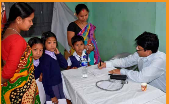
Neotia Getwel Healthcare Centre organised a free health checkup and screening camp at NHPC Regional office,Fulbari, Siliguri