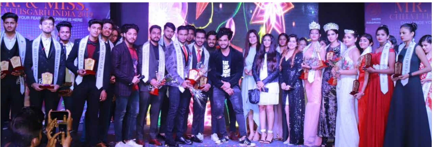
The participants of the contest joined the winners on stage after the impressive crowning ceremony