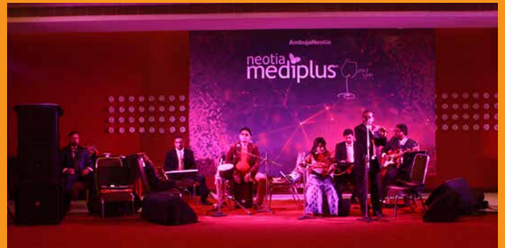
Neotia Mediplus Doctors' Annual Get-together 2019 was celebrated recently with great gusto and appreciated by all those who attended