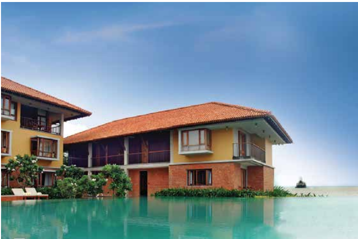
The exquisitely designed Ganga Kutir on the banks of the Hooghly