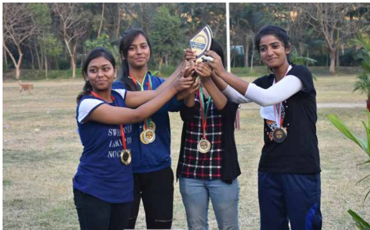
NITMAS & TNU pupils celebrate the Sports and Athletics Meet