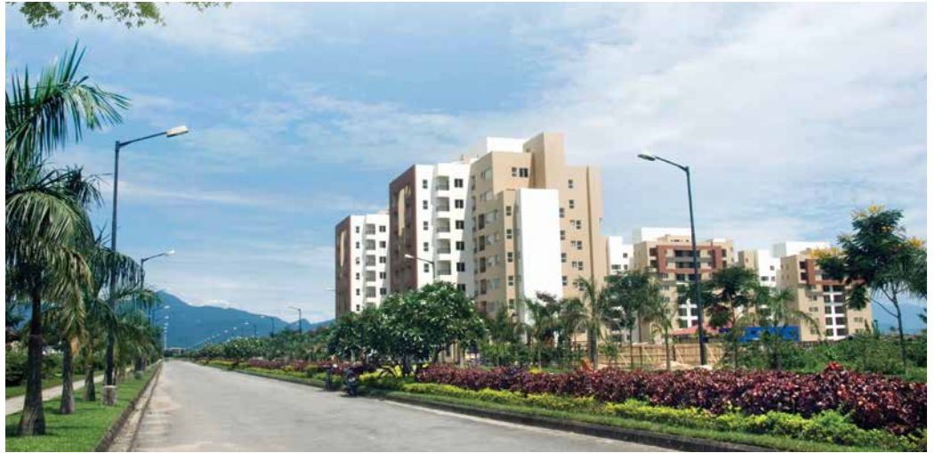
A panoramic view of Uttorayon against the backdrop of the majestic Himalayas

U ttorayon, a residential township in Siliguri, has been painstakingly developed over an area of 400 acres. This sprawling estate is divided across integrated residential apartments and bungalows and a commercial segment comprising City Centre Siliguri that houses a mall and an office tower. A premium hotel, Montana Vista, and a super speciality hospital, Neotia Getwel Healthcare Centre, also stand on the premises. A first of its kind, Uttorayon is a groundbreaking project that changed the skyline of North Bengal's Siliguri town.