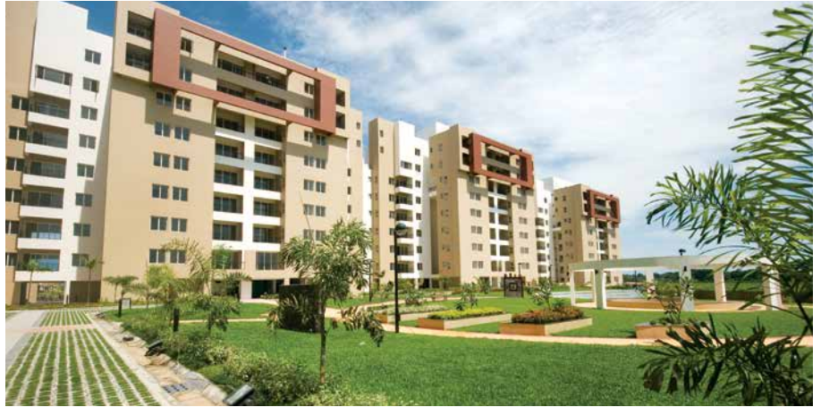
A section of the HIG apartments on the premises