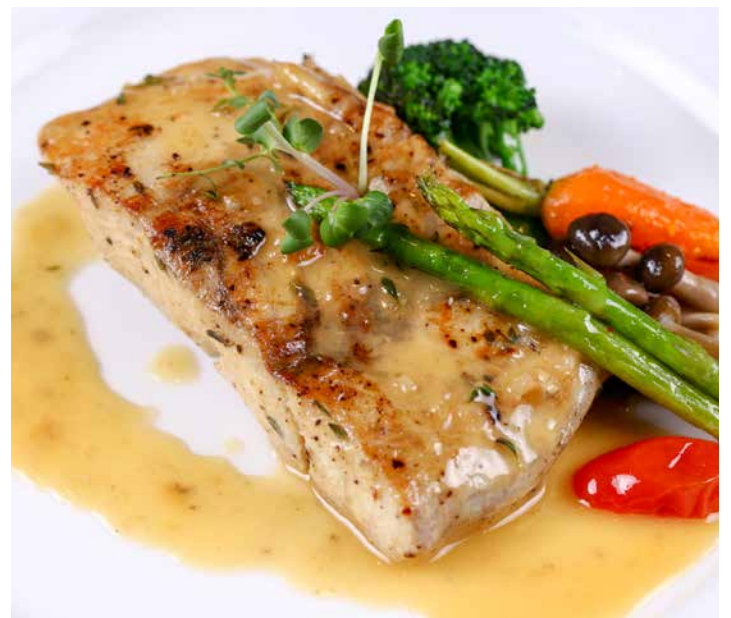
Grilled Fish in Lemon Butter Sauce served with elan at East India Room