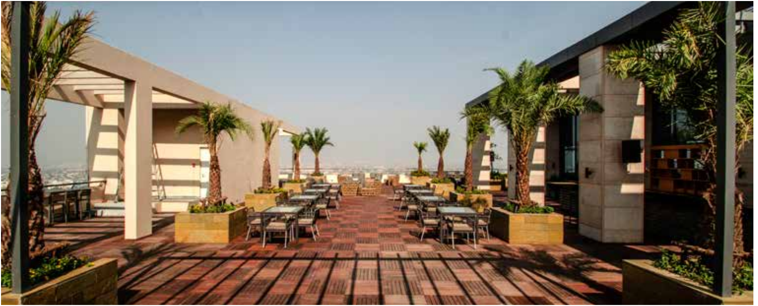
Capella at AltAir helps you to keep company with the sky and your group of friends!