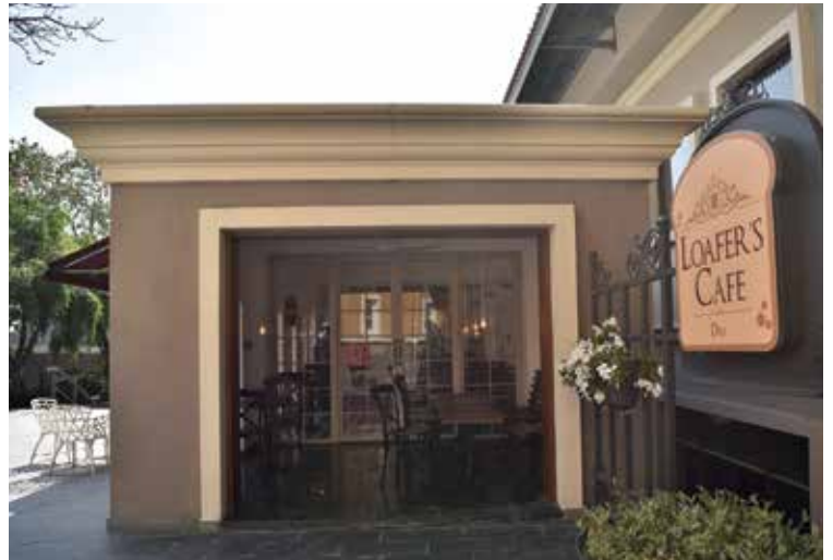
Loafer's Cafe is the ideal place for cakes, tea and sympathy!

Yes, winter is the right time to enjoy food and festivities with the vast options made available by various outlets of our Hospitality Division. If you want to indulge in a little bit of nostalgia that is evoked by afternoon teas made famous by the memsahibs, the Loafer's Café in Swabhumi is the ideal place for cha, cakes, small eats and adda. The relaxed atmosphere of UNO, also in Swabhumi, will encourage the young and the old to let down their hair over a beer and a pizza. The Capella at Altair housed in Sector V, Salt Lake, will not only give you a breathtaking view of the city but also encourage you to experience an intimate meal with the special people in your life under the stars. Aftaa at City Centre Salt Lake can be counted on to encourage family celebrations or intimate tete-a-tetes. The Orient, also at City Centre Salt Lake and City Centre New Town, will give a delectable twist to the cuisine from the Far East, while Wykiki at Swissotel Kolkata Neotia Vista will liven up evenings with music, cocktails and a select menu of street foods. Take your pick and make the winter days in your life absolutely special!