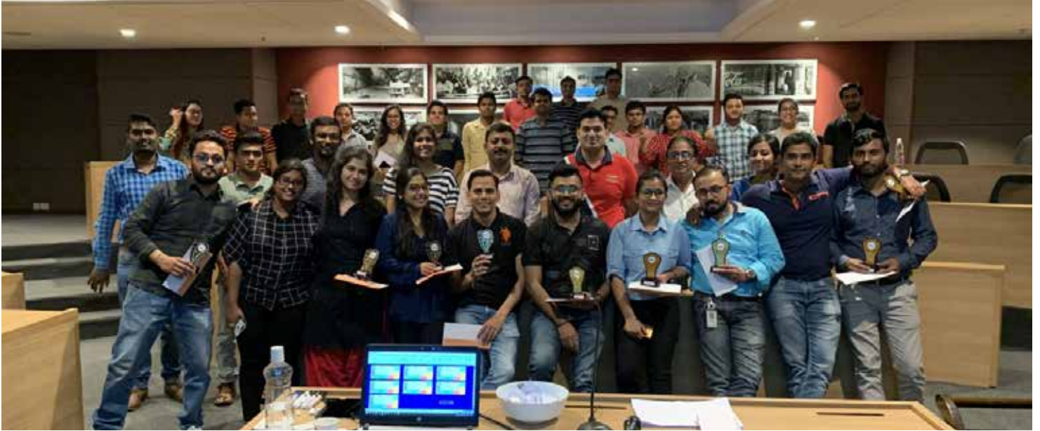
Smile please! A glimpse of the winners of the inter-department quiz competition recently organised by Ambuja Neotia's HR Department

D urga Puja is one of the most famous festivals celebrated in West Bengal and particularly in Kolkata, in honour of Goddess Durga during the period of Navaratri. Celebrated over ten days, the pandals are installed with beautiful idols of the goddess and her children and worshipped with fervour by the young and the old. According to Hindu mythology, Goddess Durga emerged from the collective energy of all our Gods as an embodiment of Shakti or divine feminine power, to destroy demon Mahishasura, the demon who was terrorising the earth. The name Durga in Sanskrit means 'the impenetrable'; she exists in a state of self-sufficiency and in ultimate power. As always, Durga Puja was celebrated this year with great pomp and festivity at The Ffort, Raichak on Ganges.