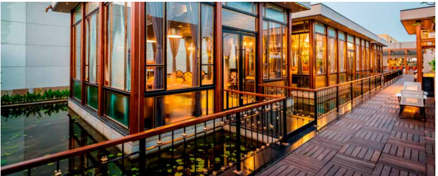
There can be no better place than Wykiki at Swissotel Kolkata Neotia Vista for cocktails, Asian street food and bonhomie