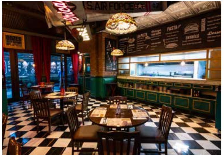
The interiors at UNO will remind you of American diners