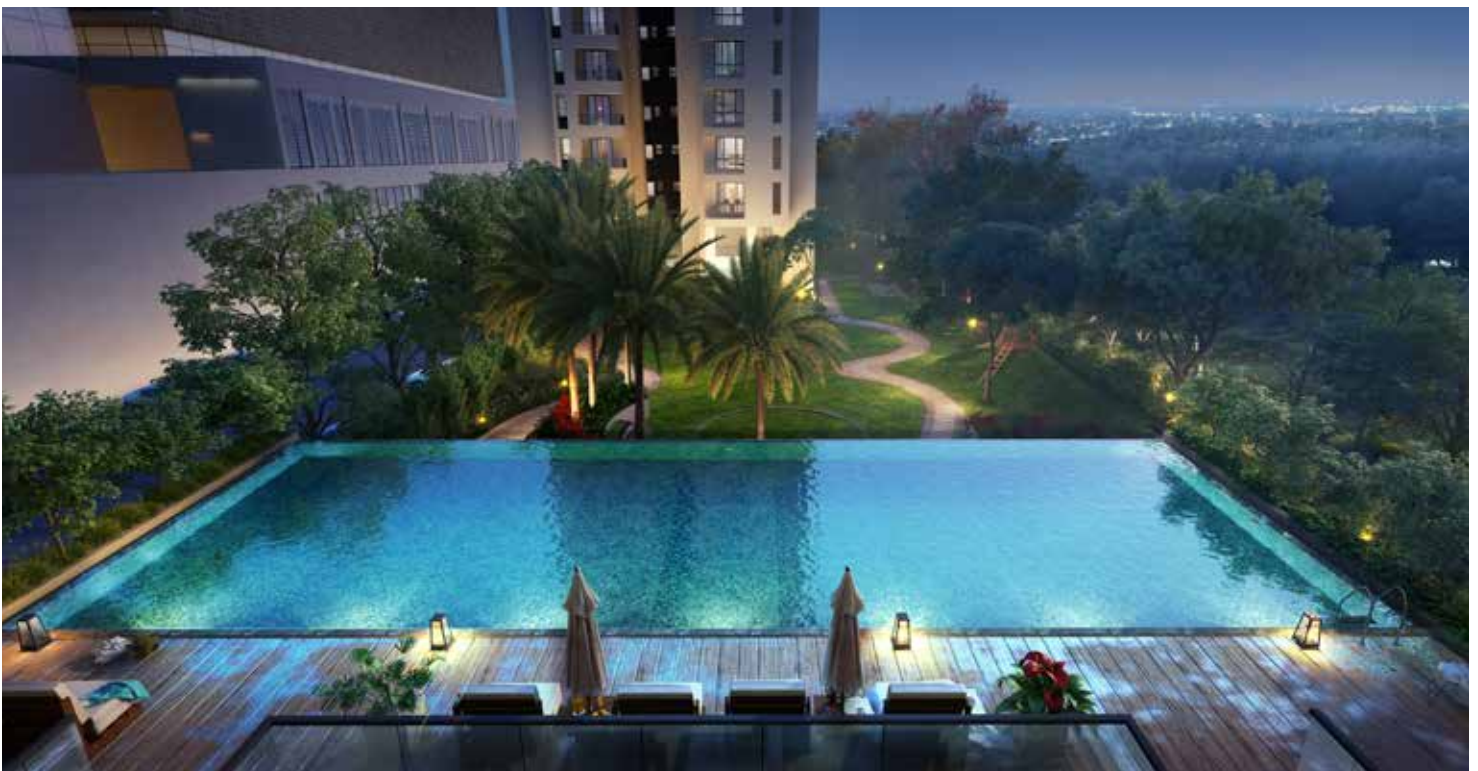
The Infinity Swimming Pool is the central attraction of the project