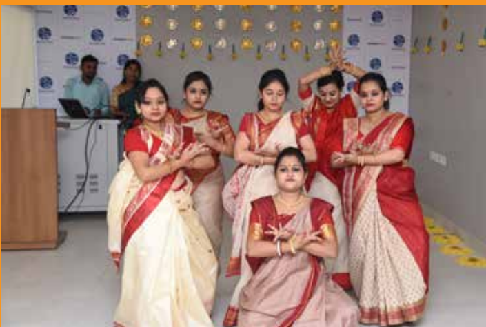
Poron Parbon 2019 was organised at Bhagirathi Neotia Woman & Child Care Centre, respectively on the New Town and Rawdon Street hospital premises. Employees, doctors, nurses and other staff members participated in this colourful pre-puja cultural programme and the ethnic fashion pageant