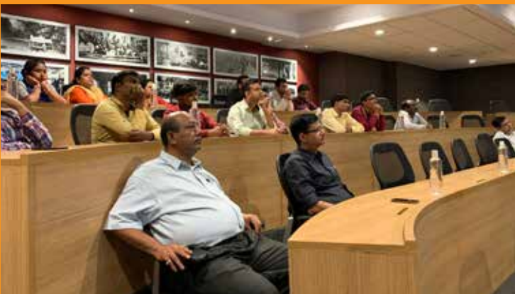
A cancer awareness programme was recently organised by Ambuja Neotia Group's HR Department for its employees in association with AMRI Hospitals on the occasion of The National Cancer Awareness Day