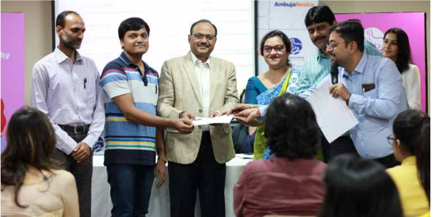
A Motherhood Health Empowerment seminar was organised by Bhagirathi Neotia Woman & Child Care Centre, Rawdon Street, where eminent consultants empowered the guests through valuable guidelines to make the journey of motherhood smooth and healthy. The hospital also made a donation to Dakshin Kalikata Sevashram for the underprivileged