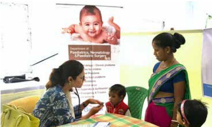
Neotia Getwel Healthcare Centre, Siliguri, organised a Free Health Checkup Camp in association with Khoribari BDO Office at Khoribari where paediatric and neonatological problems were addressed