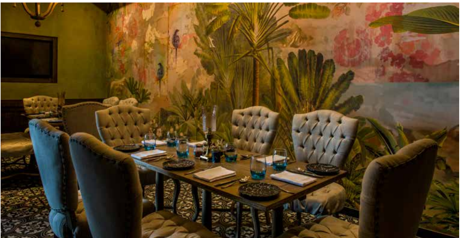
Aftaa is just the right place for family celebrations