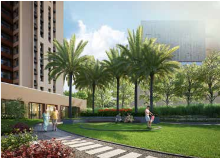
The Arbour is ideal for walks