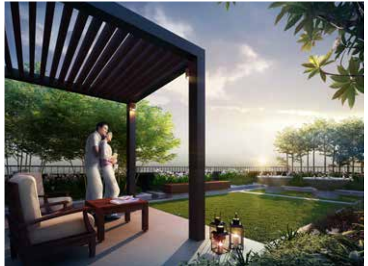
The Roof Top Activity Area is ideal for recreation