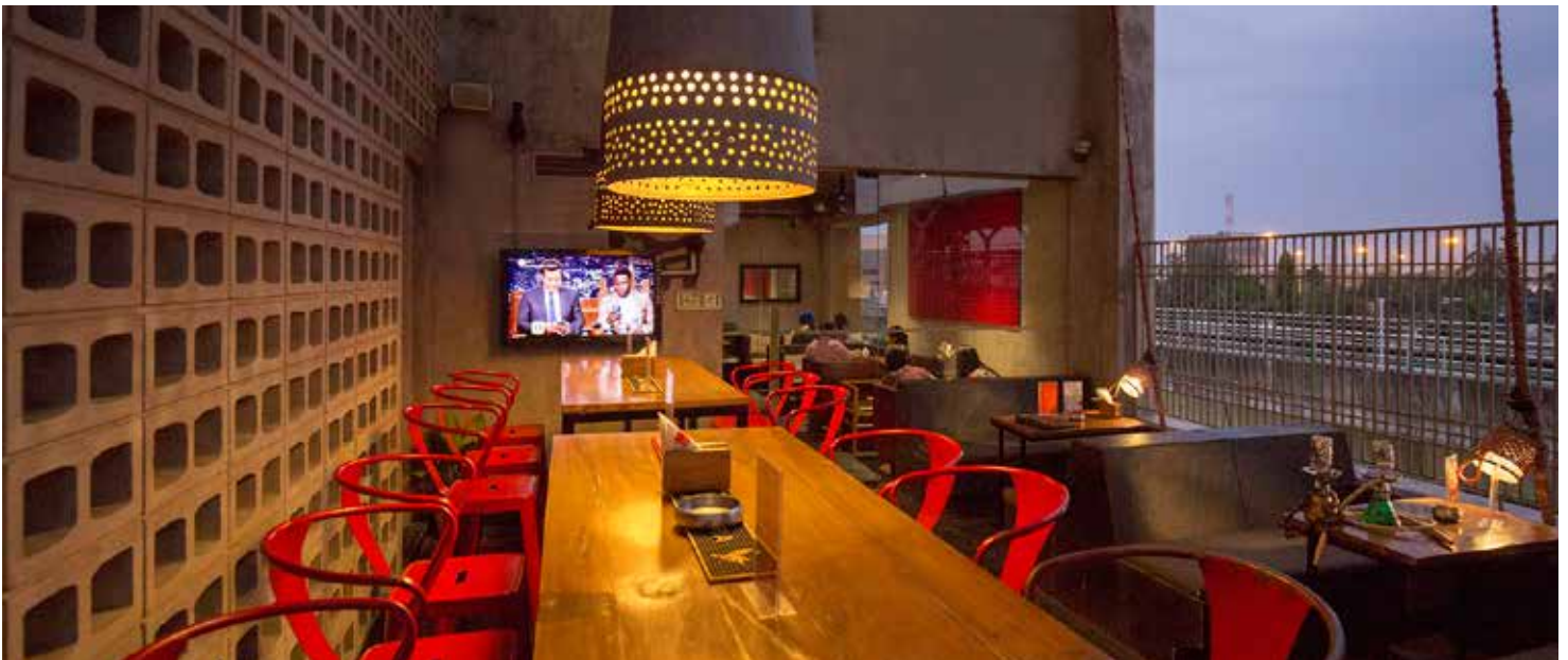
A view of The Orient at City Centre Salt Lake