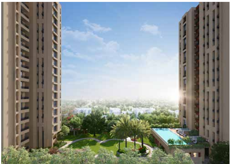
The landscaped exterior between the two towers