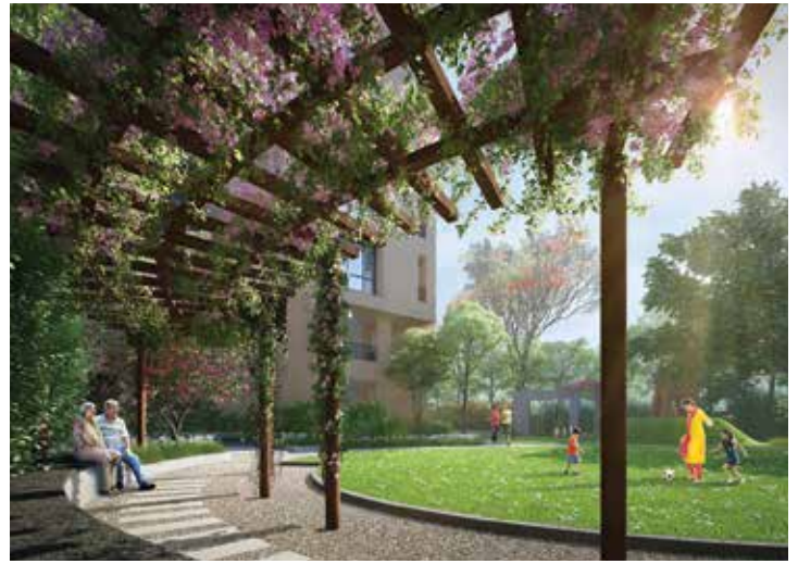
A dedicated Senior Citizen Zone