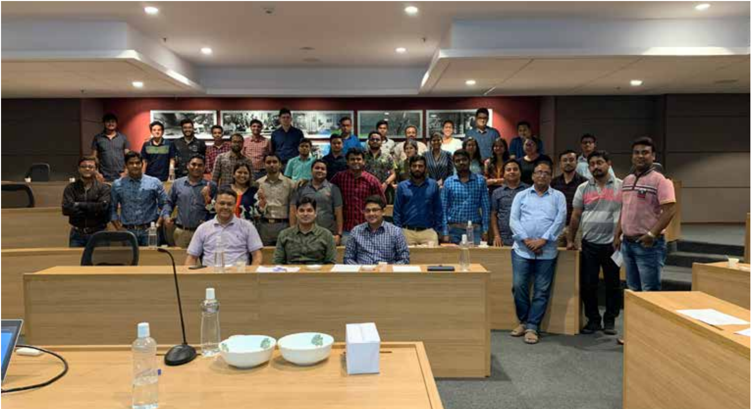
An employee engagement programme organised by the HR Department of Ambuja Neotia was held to improve team bonding, employee interaction and knowledge sharing across all verticals. Here are some participants who took part in the event