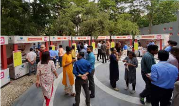
Ecospace Business Park, New Town, in association with t2, hosted a Chinese Food Festival to showcase a wide assortment of Chinese delicacies with the city's most loved Asian restaurants